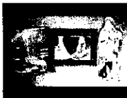
Meet Your Feet September 3, 2010