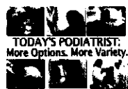
Today's Podiatrist Does It All A "music video" on careers in podiatric medicine.