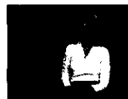
Who is "Today's Podiatrist?" Today's podiatrists speak out about their experiences.